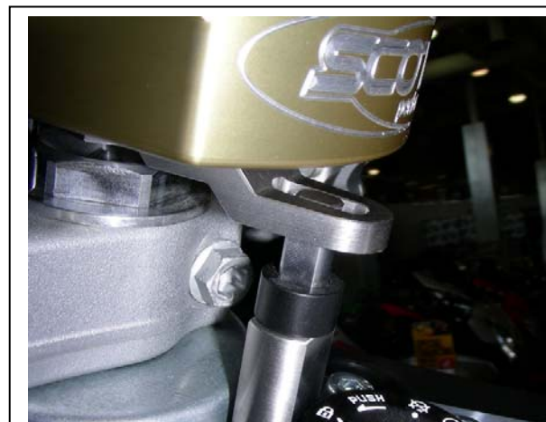
This is the correct tower pin height for this model. Be sure the tower pin does not extend through the slot too far as it can make contact with the damper body. Keep the tower pin greased in the hole.