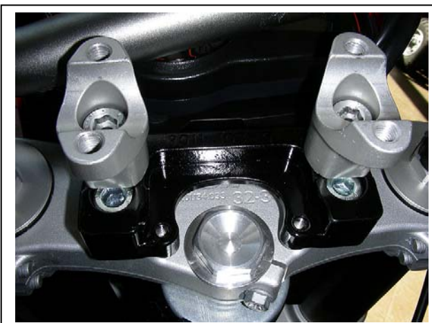
Install the black SUB mount first using the rear set of holes on the triple clamp and tighten the Allen bolts. Then install the stock lower perches and tighten. Perches can be reversed for optional bar positions.