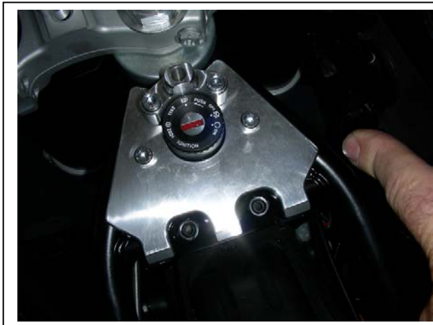
Move the top plate around until it's centered