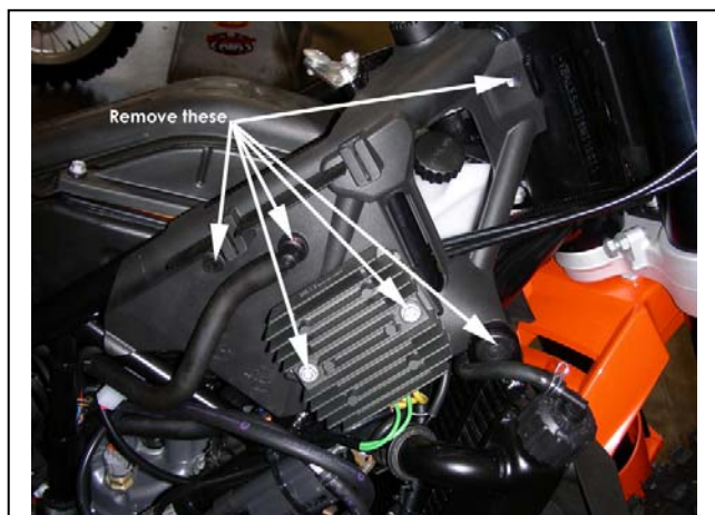
Remove here is you want to take the entire panel off