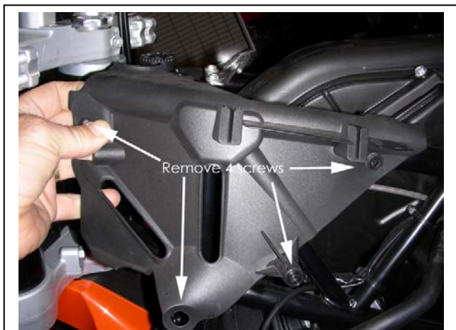
Remove screws here to remove left side panel