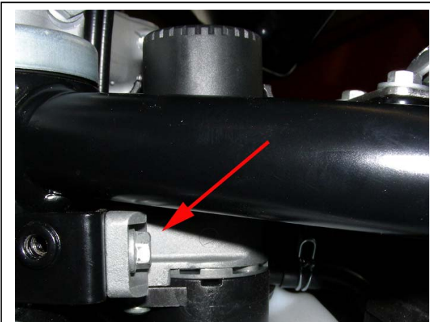
Loosen the key bolts on both sides to help alignment