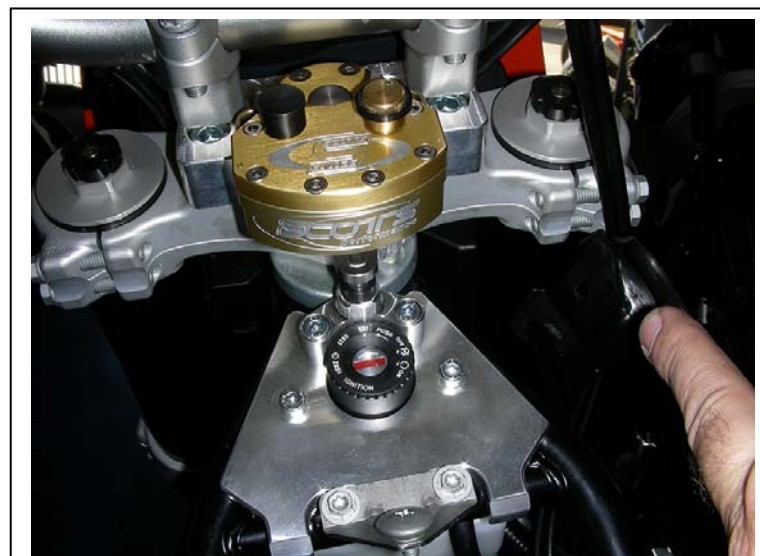
Parts are silver in this photo to show contrast for mounting ease.