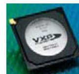
GENNUM™ GF9351 VXP™ Chip

*All specifications, dimensions and weights are subject to change without notice. D&M Holdings, Marantz, Marantz America, Inc. or any of its subsidiaries will not assume any liability for errors in this spec sheet which may result in consequential errors being made by retail dealers, designers, custom installers, cabinet makers or end users, etc based upon information contained within this document.