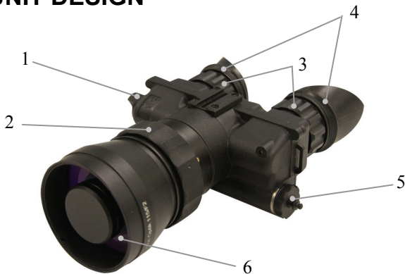
NVS7 – 4x