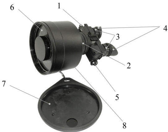
NVS7 – 8x