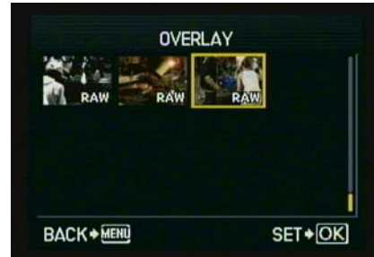
IMAGE OVERLAY / MULTIPLE EXPOSURE EDIT

In playback mode, up to 4 frames of RAW images can be overlaid and saved as a single image.