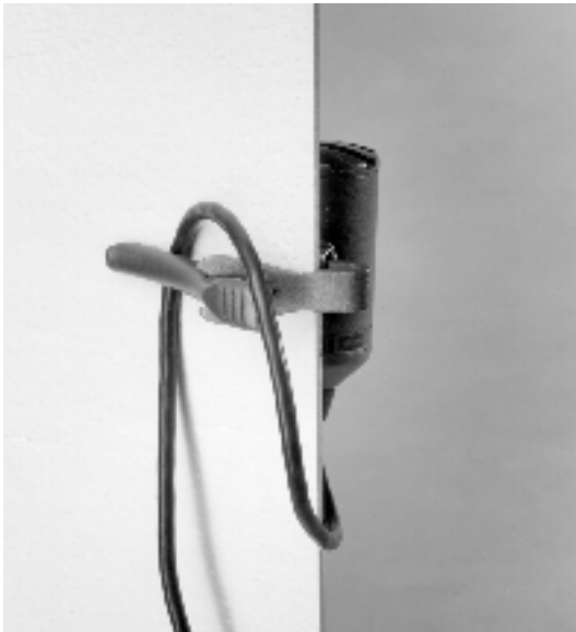
CABLE ANCHORING FIGURE 4

Insert the SM11 in the tie clasp and anchor the cable as shown in Figure 4. Affix the clasp to a tie, shirt, or blouse. Note that the microphone can be swiveled 360° in its holder for left, right, or vertical ("pen clip") use.