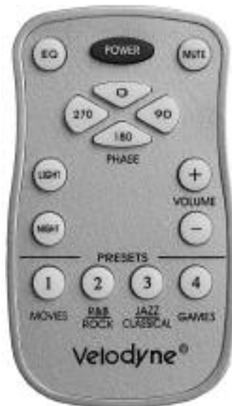
Figure 2. Remote Control

Figure 2 shows the remote control, enabling you to easily choose whatever listening mode you desire.