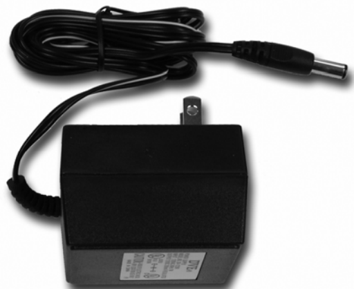
ITEM D: (1) 781RG Power Supply