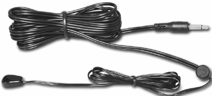
ITEM C: (4) 283M Mouse Emitters