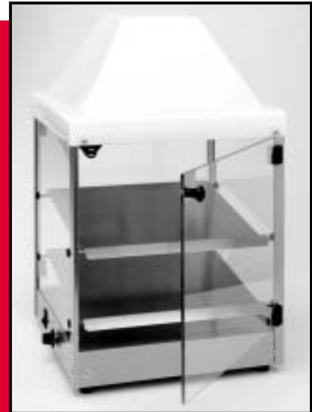
MODEL DWC-13 DISPLAY CABINET