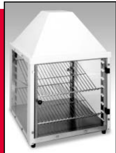
MODEL DWC-17 DISPLAY CABINET