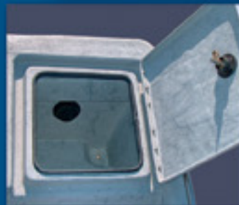
Plumbed Bait Tank