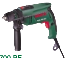
PSB 700 RE 700 Watt