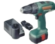
PSR 14.4 VE-2 14.4 Volt