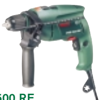
PSB 500 RE 500 Watt

The Bosch impact drills offer a simple bit change system, a vibration damping system for smooth and safe handling and electronic speed control to ensure the right speed is used for each material. With their ergonomic and stylish design, Bosch impact drills are indispensable for your tool shed.