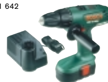
PSR 18 VE-2 18 Volt