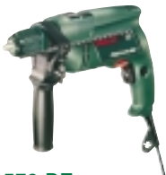
PSB 570 RE 570 Watt