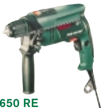
PSB 650 RE 650 Watt