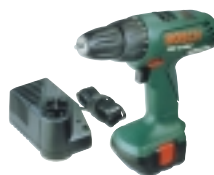
PSR 12 VE-2 12 Volt

Bosch cordless drills come complete with carry case, battery pack and fast charger and are suitable for use in wood and metal.