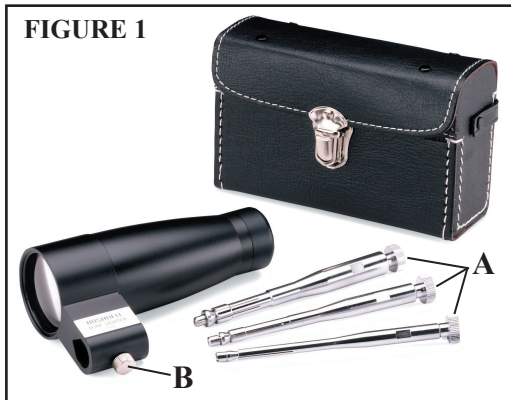
Professional Boresighter Kit Model# 74333