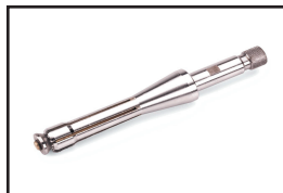
.50 Cal to 12 Gauge Expandable Arbor Model# 740012