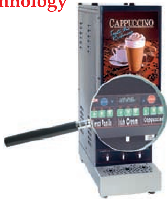
Small, Medium and Large Portion Control